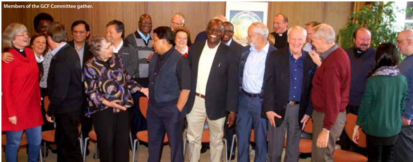
Members of the GCF Committee gather.