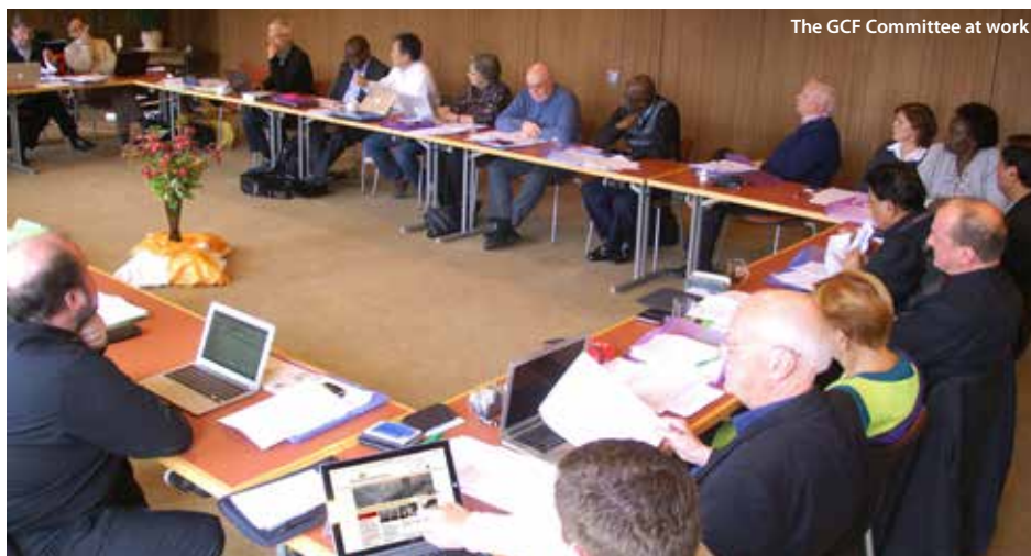
The GCF Committee at work