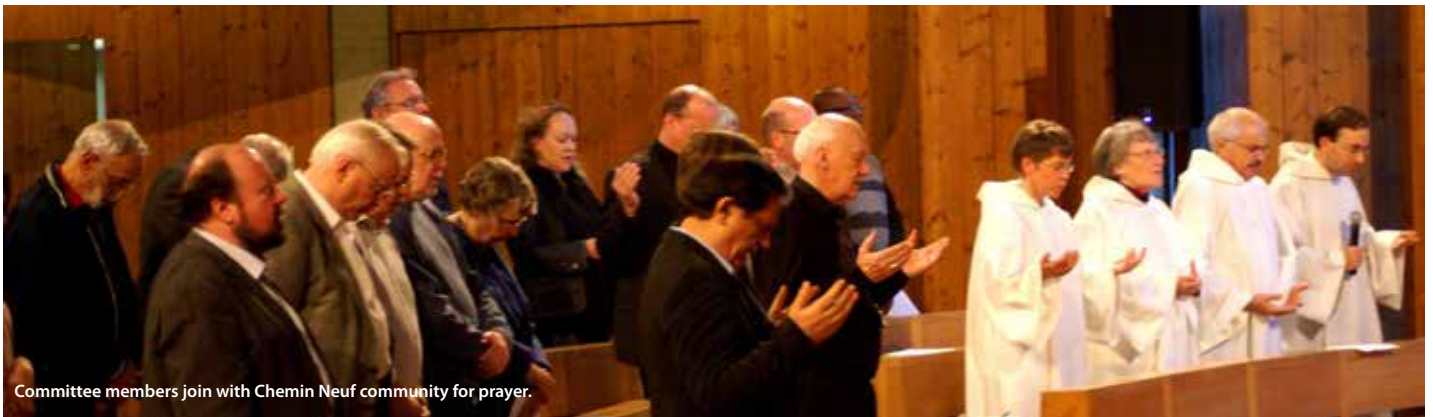
Committee members join with Chemin Neuf community for prayer.